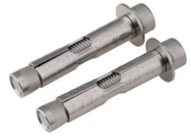
Metal screw and expansion bolt x 4