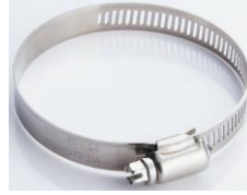
Steel hook x 2