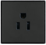
Power supply Socket x 1