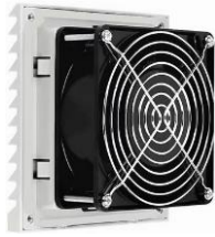
Cooling fan x 1